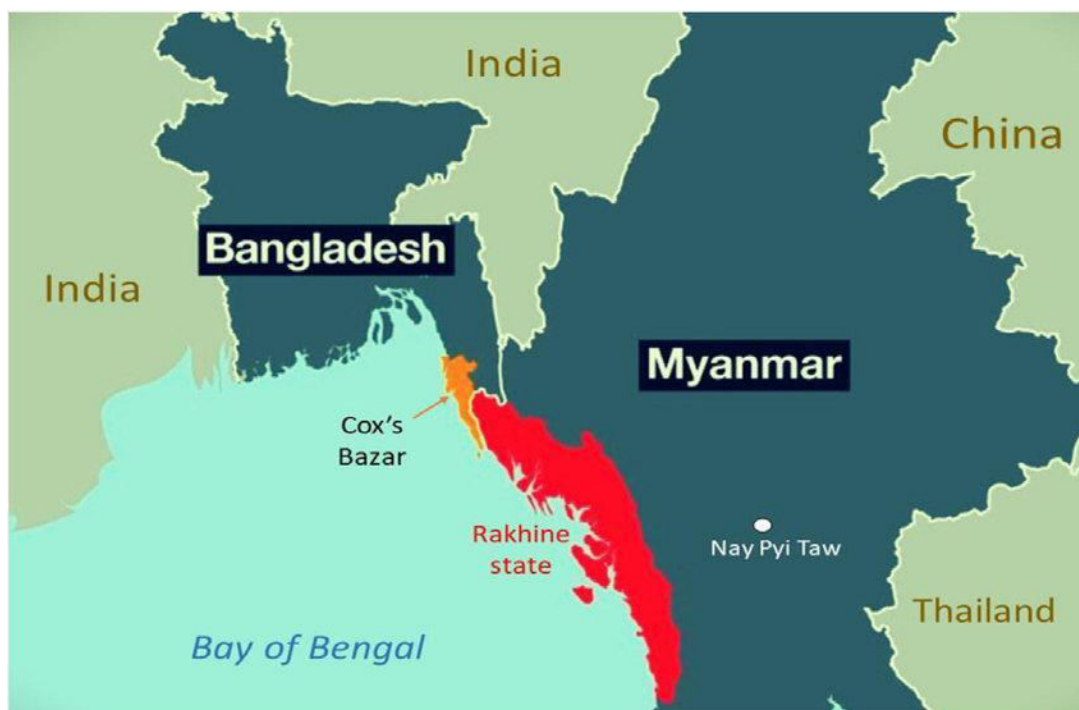
Fig. 1: Cox's Bazar, Bangladesh and Rakhine State, Myanmar.

fugees in Bangladesh. These studies found that the cost of the commodities has increased in a large scale. In contrast, income or wages for low-skilled employees have decreased as a result of the influx of Rohingya refugees in Bangladesh. The previous studies also illustrate that the natural environment has been impacted negatively; creating huge pressure on infrastructures, affecting public services badly, and numerous tensions for the local community and Rohingya refugees sheltered in Bangladesh are the major problems (Hasnat and Ahmed, 2023).